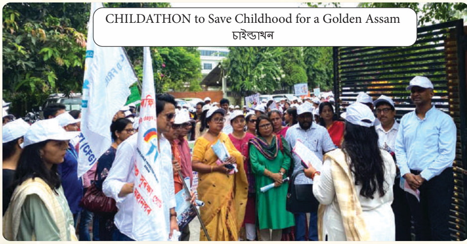
CHILDATHON to Save Childhood for a Golden Assam চাইল্ডাথন

Legal Entity of Snehalaya (Trust Deed No. 4223 of 2002)