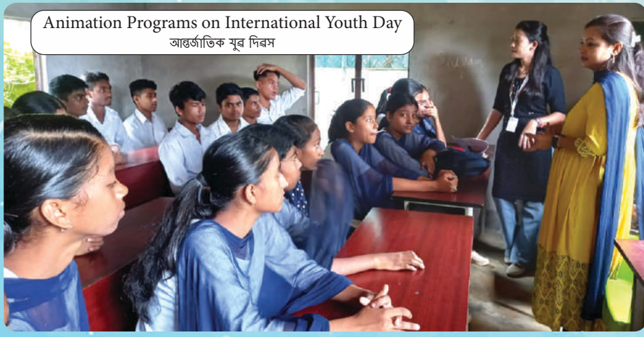
Animation Programs on International Youth Day আন্তর্জাতিক যুৱ দিৱস

The CFG campaign infuses patriotism and India's socio-cultural values among its children in the centres. In the file photo of the Kalapani CFG centre, children participate in the flag hoisting ceremony on 15th August, 2023. They had performed patriotic dances, chanted songs and enacted skits, besides conducting cleanliness drives in their respective communities.