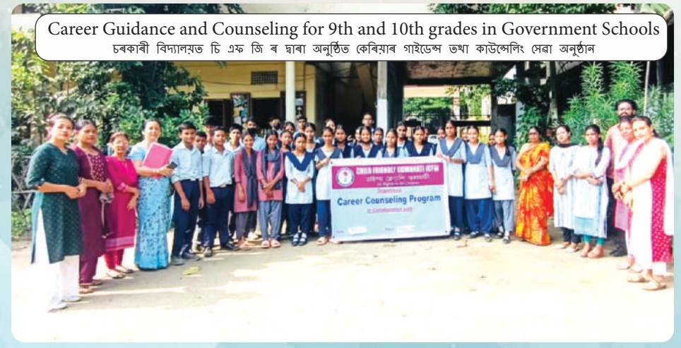
Career Guidance and Counseling for 9th and 10th grades in Government Schools চৰকাৰী বিদ্যালয়ত চি এফ জি ৰ দ্বাৰা অনুষ্ঠিত কেৰিয়াৰ গাইডেন্স তথা কাউন্সেলিং সেৱা অনুষ্ঠান

International Youth Day was observed on August 12th 2023, by the members of Children Parliaments in all the CFG centres. Visits to the Planetarium, Awareness programs and Meetings were organized to make the youth aware of their role in nation building, and avoid risky behaviours such as drug abuse.