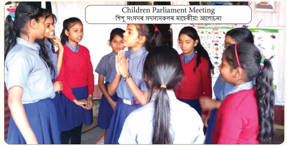
Children Parliament Meeting শিশু সংসদৰ সদস্যসকলৰ মাহেকীয়া আলোচনা

CHILDATHON was organized on August 23 in collaboration with District Child Protection Unit, State Child Protection Society and the District Administration of Kamrup (M) as part of the District Level 90 Day Campaign “Suroxito Xaixab Xonali Axom” (Save Childhood for a Golden Assam) on Child Protection. The children and the government authorities had walked in rally, raising slogans and displaying placards to protect childhood, and ensure all rights to all children.