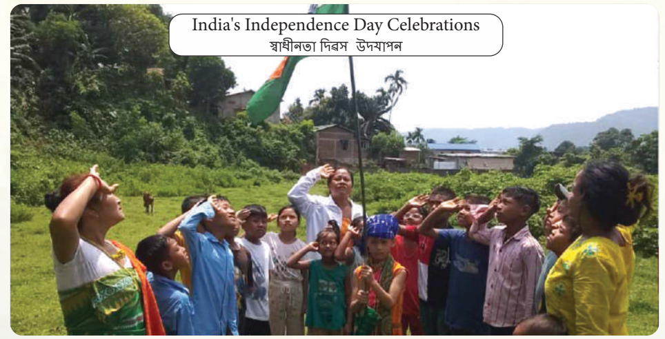
India's Independence Day Celebrations স্বাধীনতা দিৱস উদযাপন