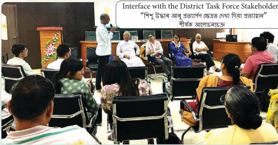
Interface with the District Task Force Stakeholders “শিশু উদ্ধাৰ আৰু প্ৰত্যাপন ক্ষেত্ৰত দেখা দিয়া প্ৰত্যাহ্বান” শীৰ্ষক আলোচনাচক্র

What actually happens in a CFG centre? Well, the teachers engage in tuition classes for children in the after-school hours. They help children to conduct ‘Children Parliaments’. Co-curricular activities coupled with life-skills are imparted. Counseling is made available for all the children. Children of Bamunimaidam CFG centre are seen in the above photo.