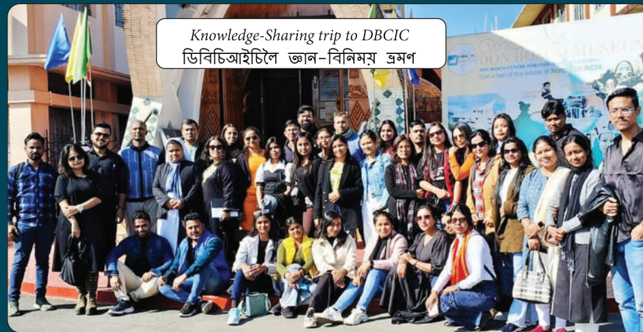
Knowledge-Sharing trip to DBCIC ডিবিসিআইচিএল জ্ঞান-বিনিময় ভ্ৰমণ