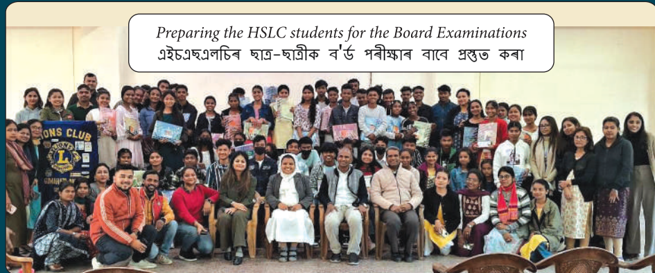
Preparing the HSLC students for the Board Examinations এইচএছএলচিৰ ছাত্ৰ-ছাত্ৰীক ব'ৰ্ড পৰীক্ষাৰ বাবে প্ৰস্তুত কৰা

Legal Entity of Snehalaya (Trust Deed No. 4223 of 2002)