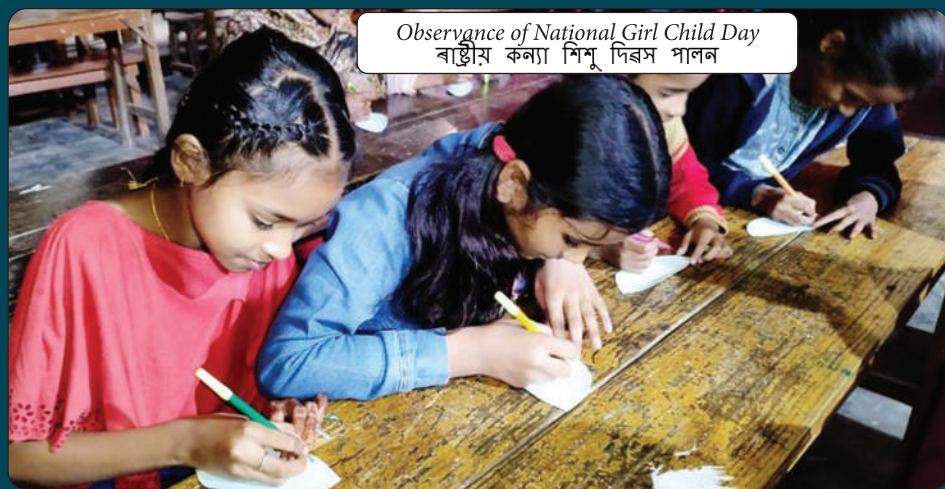
Observance of National Girl Child Day ৰাষ্ট্ৰীয় কন্যা শিশু দিৱস পালন

120 life- skills sessions have been conducted in 21 Government schools for the adolescent children of 6-8 grades in all 36 CFG locations. The sessions were designed to help the children develop skills including problem solving, effective communication skills, decision-making, creative thinking, interpersonal relationship skills, self-awareness building skills, empathy and coping with stress skills through various well-designed activities.