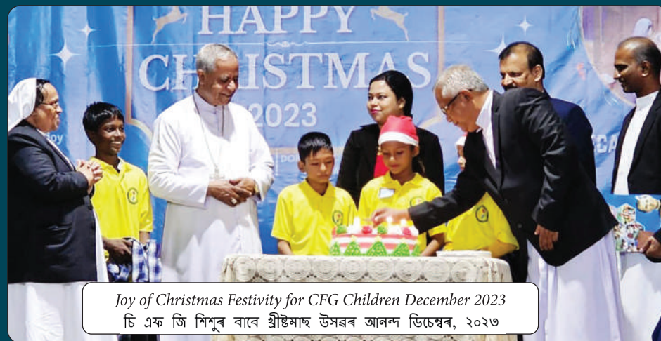
Joy of Christmas Festivity for CFG Children December 2023 চি এফ জি শিশুৰ বাবে খ্ৰীষ্টমাছ উসৰৰ আনন্দ ডিচেম্বৰ, ২০২৩