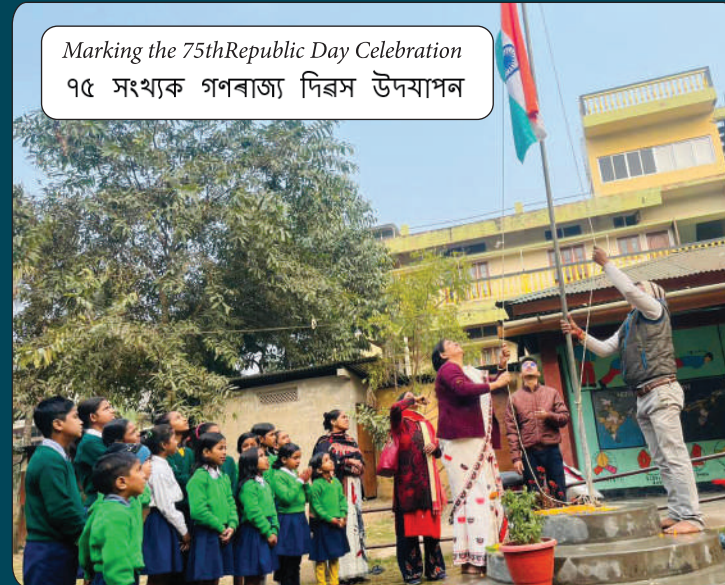
Marking the 75th Republic Day Celebration ৭৫ সংখ্যক গণৰাজ্য দিৱস উদযাপন

On 26th January 2024, the CFG children and staff have patriotically celebrated the 75th Republic Day of India by unfurling the Tri-colour and singing the National Anthem. The children were made aware of the Constitution and its Preamble- Sovereign Socialist Secular Democratic Republic.