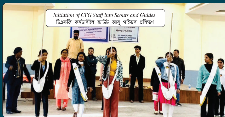
Initiation of CFG Staff into Scouts and Guides চিএফজি কৰ্মচাৰীলৈ স্কাউট আৰু গাইডৰ প্ৰশিক্ষণ