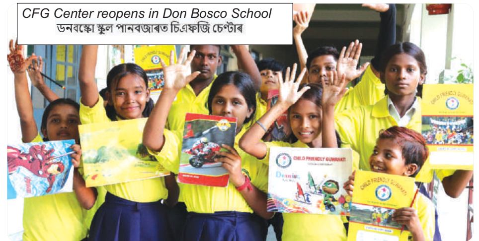
CFG Center reopens in Don Bosco School ডনবস্কো স্কুল পানবজাৰত চি.এফ.জি চেণ্টাৰ