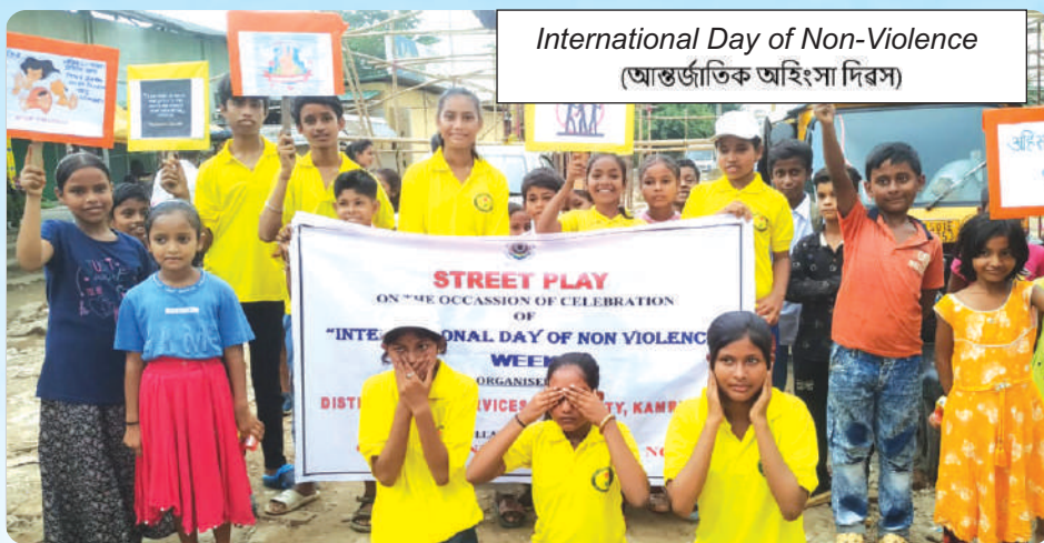
International Day of Non-Violence (আন্তর্জাতিক অহিংসা দিৱস)

The CFG campaign continues to form ward level Child Protection Committees (CPCs) in all 36 wards of GMC, where it operates and reaches out to children in need of care and protection. On 27th September, 2023, and 17th October, 2023 CPCs were formed in Narengi and Panjabari Communities respectively. The CPCs raise awareness and address children's issues at community level.