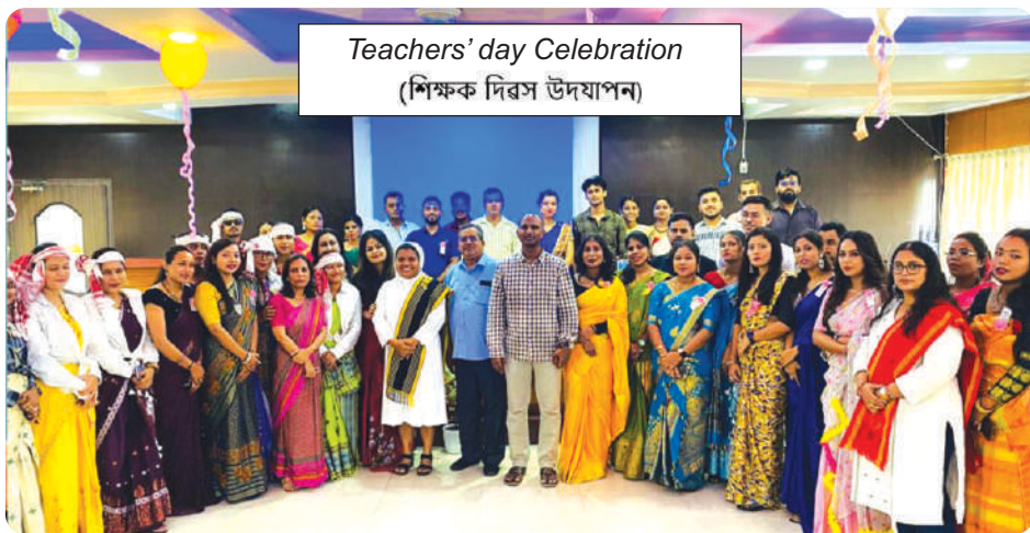
Teachers' day Celebration (শিক্ষক দিৱস উদযাপন)

Celebrating Gandhi Jayanti in all 36 CFG centers was one of the delightful events in the month of October. Besides the dramas, songs and celebration, the children were taught the values lived and propagated by the Mahatma. Cleanliness drives and plantation activities were taken up as part of the day.