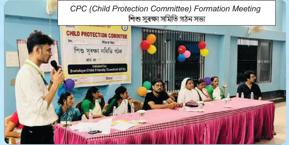
CPC (Child Protection Committee) Formation Meeting শিশু সুৰক্ষা সমিতি গঠন সভা

International Day of the Girl Child was celebrated meaningfully with 350 girls from 36 CFG centers who had gathered in Bethany School, Gorchuk. The dances and thought-provoking skit performances were well performed. Girls were encouraged to be mentally tough, heartfully kind, fun-loving, goal oriented, determined and courageous.