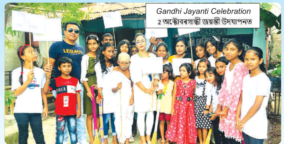
Gandhi Jayanti Celebration 2 অক্টোবৰগান্ধী জয়ন্তী উদযাপনত

On 6th September 2023, street plays were organized in Gorchuk, Ganeshpara and Kotabari areas by CFG children observing the "International Day of Non- Violence". The CFG children are "Children in Need of Care and Protection". Most of them have experienced hardship, realities of abuse, neglect, abandonment and violence. The events were carried out in collaboration with DLSA (District Legal Services Authority).