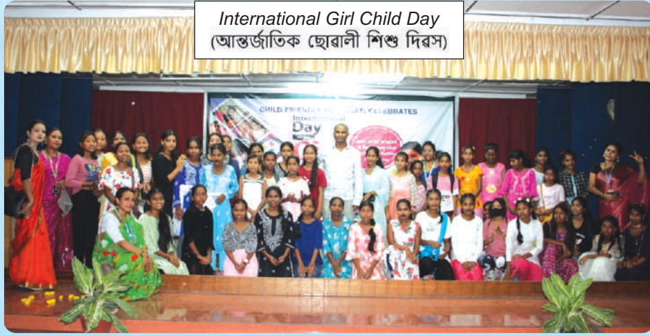
International Girl Child Day (আন্তর্জাতিক ছোৱালী শিশু দিৱস)

Legal Entity of Snehalaya (Trust Deed No. 4223 of 2002)